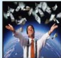
Kaun Banega Crorpati Vitamin 'M' Workshop