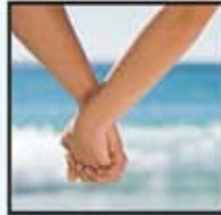
Pro - Sex Seminar