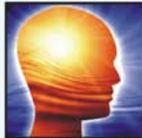
Pro - Mind Workshop