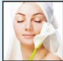
Pro - Skin Workshop