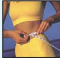
Pro - Slim Workshop for obesity