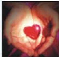
Pro - Heart Workshop