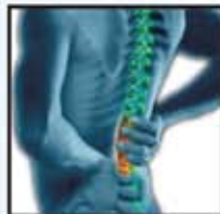
Pro - Backe Workshop