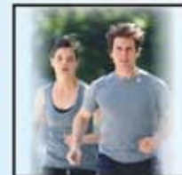
Raho Yuva Sada Ke Liye